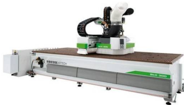
Fig. 2 Qubia's CNC Router

Biesse is an Italian engineering machinery manufacturer which commits to provide advanced machineries with superior quality for various types of manufacturers to achieve a more productive and efficient production process. Through the great efforts for over 40 years, the company made considerable progresses in products innovations and also won the global reputation as a reliable supplier. Skill 300 is one powerful CNC machine center that is produced by Biesse, and it is mainly designed for nested panel cutting, so it is ideal for small or medium sized cabinet manufacturing applications. This machine is user- friendly since it uses Windows-based control system that most people are familiar with. The maximum rotation speed of the high-speed spindles is 6000rpm; and the maximum rotation speed of the electro-spindle is four times faster than the previous one (Biesse Wood Division). The outstanding high rotation speed of the spindle is not only increasing the production rate, but it also improves the product quality because it can create a smoother surface. According to the price offered by TNG Machinery, a brand new Biesse Skill 300 CNC machine center is pricing at $98,500 (tools included) (TNG Machinery New Used Listing –Winter, 2009).