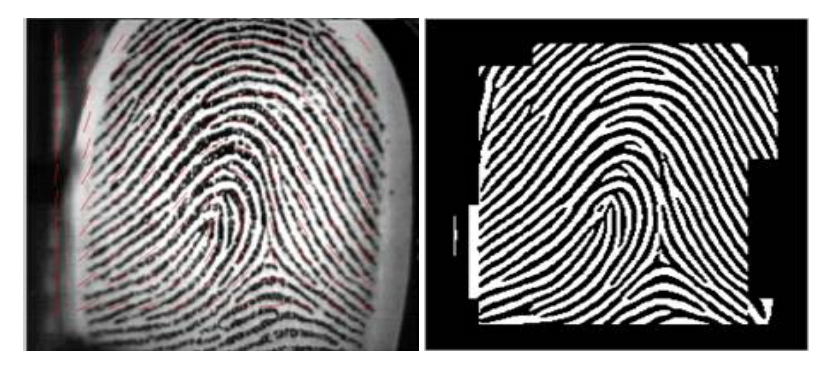
Fig. 6 Ridge orientation image