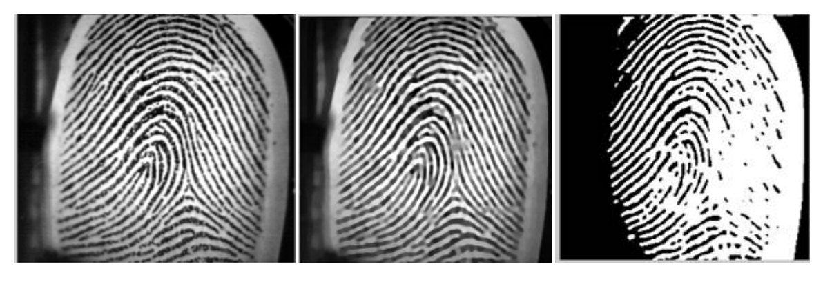
Fig. 3 Original image

Figures show the results of noise removal from an image by using firefly algorithm to improve the significant feature selection process. The input is given as original latent fingerprint image and fingerprint to be enhanced, also consider the Gabor dictionary. Image is decomposed by the TV model and the multi-scale patch based sparse representation is iteratively applied on original latent fingerprint image to construct the high quality fingerprint image. After apply firefly algorithm to optimize the ridge segmentation for better ROI extraction by selecting best threshold and best block size and obtain enhanced fingerprint image