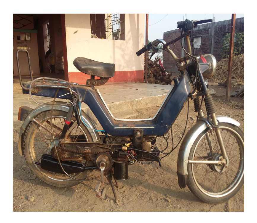
Figure No.4 Assembly

In the assembly we implement the fabricated turbocharger to the silencer of vehicle. In this assembly the arrangement consist of the turbine wheel, blower and the bush, bearing. The outlet of the turbocharger is attached to the intercooler and the intercooler outlet attached to the carburetor of the engine through the pipes.