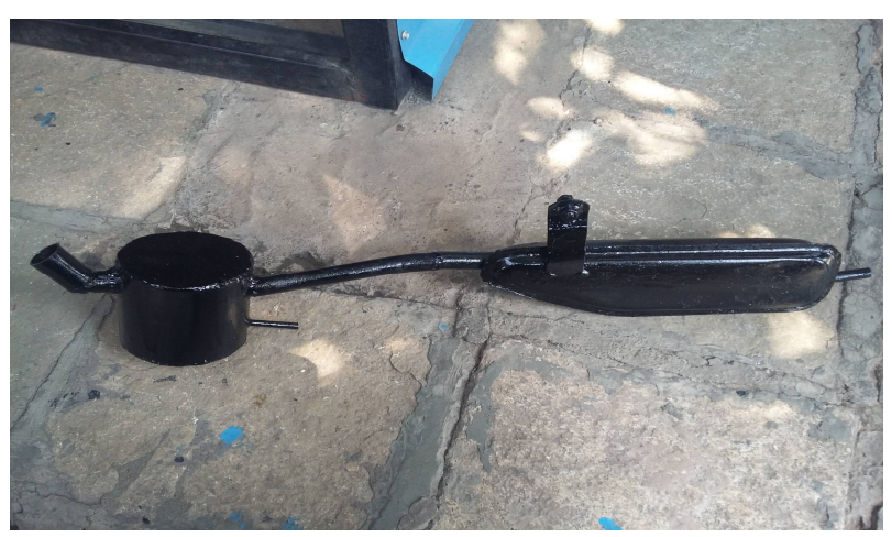
Figure No.3 Construction of Turboc