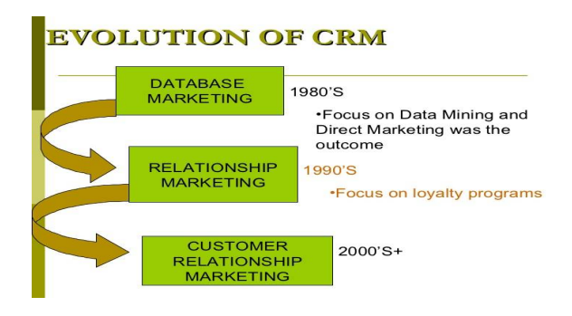
Figure 2: Evolution of CRM

During 1980'S Database Marketing focused on Data Mining and the outcome of this was Direct Marketing .During 1990's Relationship Marketing focused on loyalty programs. Advanced planning and scheduling, e-business solutions such as Customer Relationship Management, concept supported by latest technologies came into existence during 2000's.