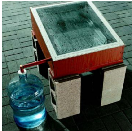
Figure 2: Solar distillation plant

beneath this glass case. Since copper is a very strong thermal medium, heat can be transmitted evenly. The wicks are fixed beneath a copper board. Cellulite is the lower component. The wick extends from the top glass box to the ground water supply through the cellulite box. The sun rays inside the glass housing, and so on. The copper plate is heated at this time. The hot copper board has heated the wick beneath the copper board. Water is then vaporized within the wick and vapour exits the wick. When water evaporates, the vapour of water increases, condensing for collection in the glass surface in figure 1 and figure 2. This method prevents impurity as well as destroys microbiological species. In the end, water is cleaner than rainwater [2]. Water to be cleaned is poured into the still to partially fill the basin. The glass cover allows the solar radiation to pass into the still, which is mostly absorbed by the blackened base. This interior surface uses a blackened material to improve absorption of the sunrays. The water begins to heat up and the moisture content of the air trapped between the water surface and the glass cover increases. The heated water vapor evaporates from the basin and condenses on the inside of the glass cover. In this process, the salts and microbes that were in the original water are left behind. Condensed water trickles down the inclined glass cover to an interior collection trough and out to a storage bottle.