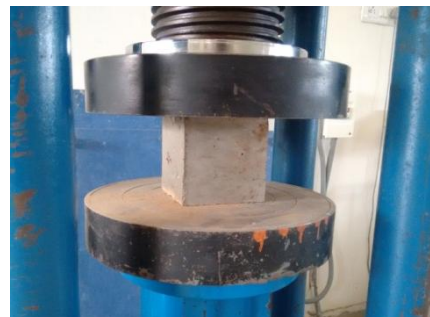
Fig. 4: Tecting of cubes