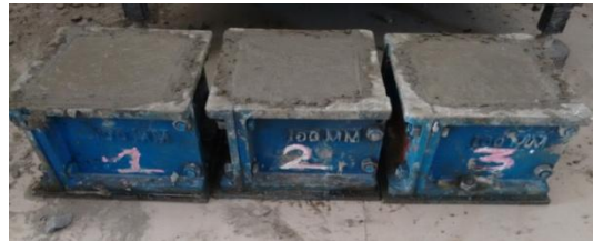
Fig. 2: Casting of Cubes