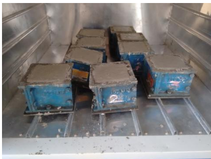
Fig. 3: Temperature Curing

By using the quantity of materials mentioned in the Table 3, the 100 mm size cube were casted. Under the Mix A and mix B, the total 5 different mixes were casted for various concentration of NaOH. ( ie. 8M, 10M, 12M, 14M, 16M). For each concentration of NaOH the 4 mixes were casted for various curing conditions and percentage of OPC. Out of four mixes, the first mix was prepared for temperature curing. Second mix was prepared for curing at room temperature. Third and fourth mix were prepared for 5% and 10% OPC with curing at room temperature respectively (ie. Ambient curing). The cubes of mix first were kept in hot air oven for temperature curing for 24 hours at 80°C. The cubes of mix second, third and fourth were kept in room for ambient curing. Similarly, the same mixes were prepared under mix 2. Under mix A and mix B, total 40 mixes were used for this study. In each mix for each parameter, three cubes were casted to determine the compressive strength. The casting and testing have done as per the respective Indian standard codes.