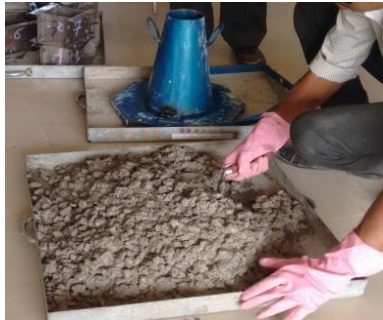
Fig. 1: Geopolymer concrete