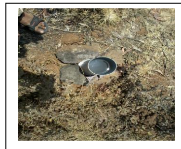
(a)Evaporimeter Installed in Water body and at Ground Surface