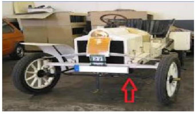
Fig 1.3: Old Vehicle Dependent System

Dependent suspension system is the system in which two wheels (front or rear) are connected to each other by one continues rod called as trailing rod. In this system if any bump or potholes disturb to one wheel automatically pair wheel also affected because of trailing rod. The trailing rod is shown by arrow in figure 1.3.