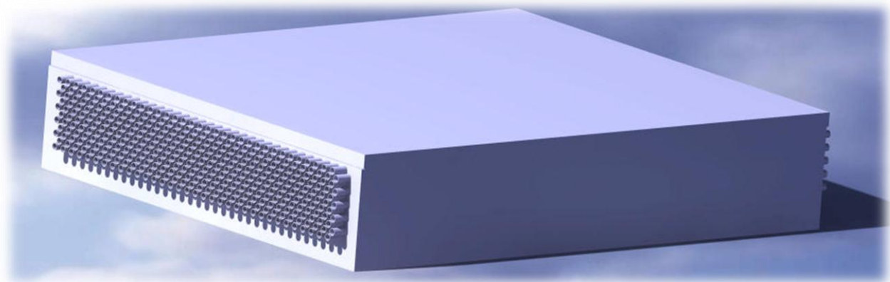
Fig CATIA drawing of reheater

The below shown diagram represents the CATIA drawing of reheater designed.