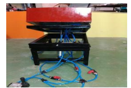
Fig.4- fig show actual view of multistage dumping trolley

In this paper on Design and Development of Multistage Dumping Trolley by OmkarBagade, VaibhavDeokar, A.H.Pawar. They redesigned, Conventional dumping trolley operates on hydraulic system to dump the material on back side only. The areas where limited space is available, one side dumping is not feasible. So provision of dumping on either side is developed through the concept of Multistage Dumping Trolley (MSDT). This paper presents design and development of MSDT operates on pneumatic system.