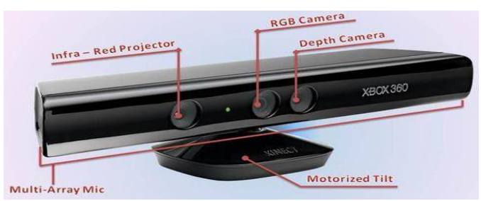
Figure 4 Kinect Device

Kinect Device [1] is developed by Primes Sense Firm which acquires 3D sensing Technology. It consists of various components in it like IR camera, Color Camera and infrared Projector. The IR camera is used for distance ranging device like the camera autofocus works.