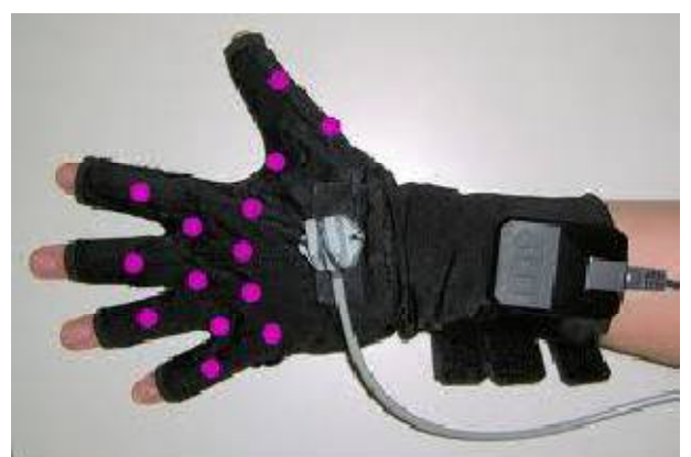
Figure 1 Glove Based System.

The Data glove construct using optical and mechanical sensor connect to a glove which will convert finger flexion's into some electrical signals for identifying the hand posture. This technique blocks the ease of naturalness of the human interaction because it complex to carry load of cable which will be connected to the machine and the instrument is very expensive and difficult to handle. Fig. 1 Show the Glove Based System.