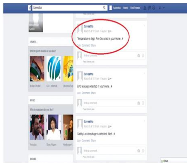
Fig.2: Temperature Detection

If accidentally fire occurred in the user home, when the user is not available, the temperature sensor detects the room temperature continuously. If the temperature of the room is high means i.e. above the normal temperature, it detects and sends the status to the microcontroller. The microcontroller passes the status to the Ethernet gateway via serial communication interface and finally the status is posted on the Facebook. The output screen shot of temperature detection is given below.