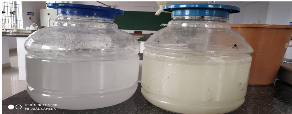
Fig 2: Dairy Wastewater and Purified Dairy Wastewater