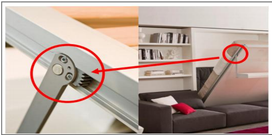
Fig. 2: Special hardware no. 1 used in model

The main functions of the special hardware are to ensure the transformable parts can be moved smoothly and safely (Fig. 2 & Fig. 3).