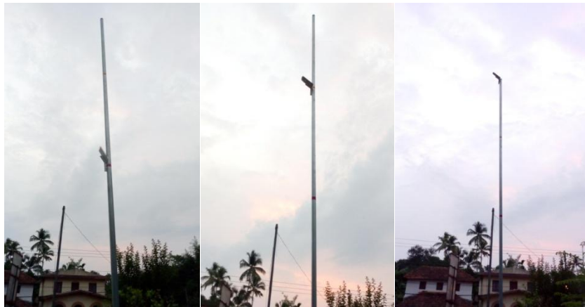
Figure 1: Installation of proposed system.

The first set of reading is taken at a height of 20 feet on the pole with 0 degree inclination of the luminary. After that the inclination is changed to 45 degrees and there after it is changed to 70 degrees respectively.