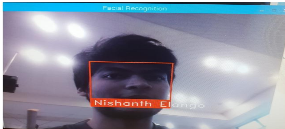
Fig. 3. Recognised Face