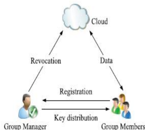
Fig. 1. System model.

We consider a cloud computing architecture by combining with an example that a company uses a cloud to enable its staffs in the same group or department to share files. The system model consists of three different entities: the cloud, a group manager (i.e., the company manager), and a large number of group members (i.e., the staffs) as illustrated in Fig. 1.