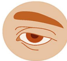
Difficulty moving the eyes or drooping eyelids

In rare cases people may also experience: