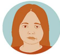
Facial droop or weakness