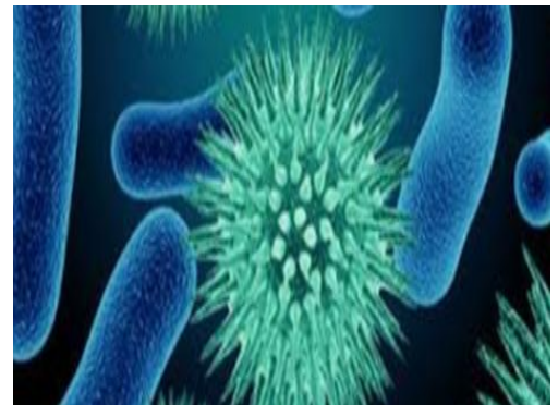
Structure of EV-D68

The large number of AFM in the year 2014 coincided with a national outbreak of severe respiratory illness caused by EV-D68. CDC tested various samples for detection of cause from affected individuals, they found Coxsackie virus A16, EV-A71 & EV-D68 in spinal fluid of 4 out of 570 confirmed cases of AFM since 2014. While in other patients there is no pathogen has been detected in their spinal fluid examination. And all the stool tests from AFM patients reported negative for polio virus.