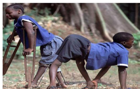
Children affected with Acute Flaccid Myelitis

ABSTRACT: Acute flaccid myelitis is a disease which found to affect children mostly than adults. It's exact cause was still unknown but to some extent it was believed due to viral infection ,this infection is found to effect the spinal cord leading to paralysis .Mostly the disease is found to develop in children after a viral infection ,it is difficult to diagnose as the symptoms initially was similar to that of flu & exact treatment was not known. Research is still going on for correct treatment . And the case was increasing day by day, presently it was treated by immuno-globulins (IGg) & anti viral therapy , soon the exact treatment will come to force, hence preventing the disease is the best option, by maintaining hygienic condition.