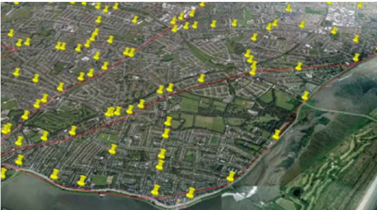
Figure3: showing the number of devices connected based on mobile data connected to service providers i.e., criteria-2.

All these UI(User Interface) was designed for the designing the graph in the pictorial representation.