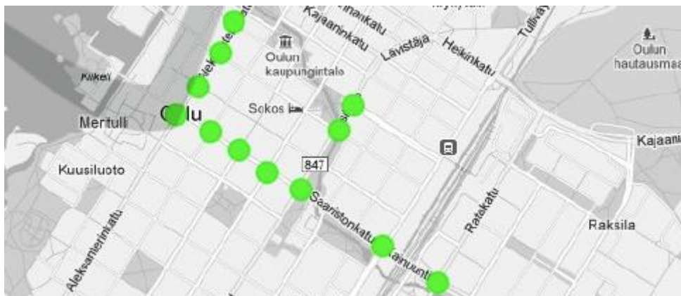
Figure 5: Representation of route by our proposed mechanism

They must repeat all the above steps if other intersection information is needed. The interviews brought three specific user groups to our attention. The traffic management employees that have to export data to Excel and do manual processing to generate statistics.