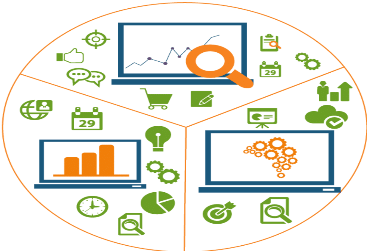
Figure1: Overview of Big data

Huge Data is an accumulation of enormous informational collections that can't be sufficiently handled utilizing conventional preparing strategies. Huge information isn't just information it has turned into a total subject, which includes different instruments, systems and structures.