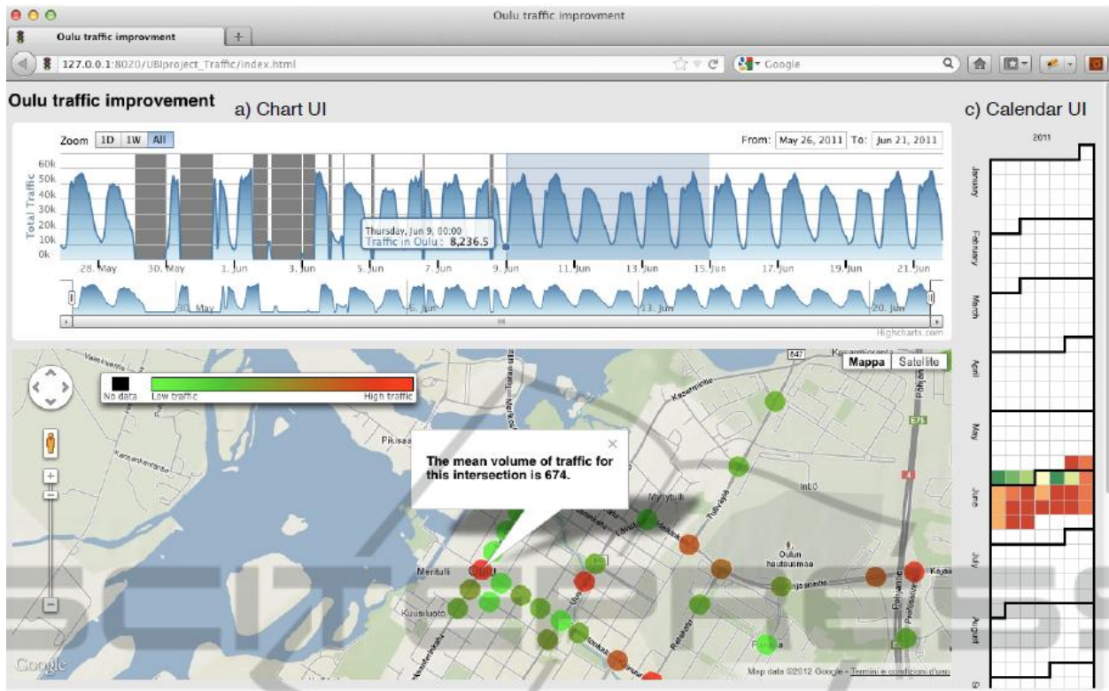
Figure 6: Traffic monitoring based on specific time showing by help of graphs

A ton of exertion is required and a framework that enables graphical and real-time factual examination of traffic information is wanted. The traffic cops are keen on a continuous figuring of the traffic since this can help them to place units a head where the majority are moving. Finally, city organizers consider traffic estimation as significant data for city plans.