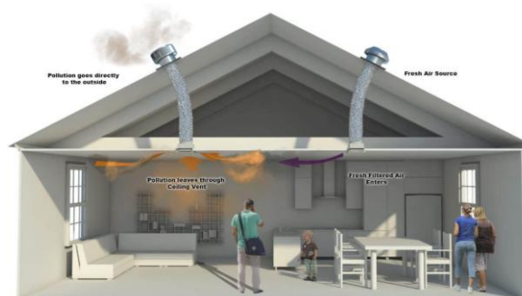
Fig no:1 Hot air extraction-stack effect

The main function of free spinning RTV is to provide fresh air in room, space and living areas all year around 24 hrs a day free of charge. By using this the better air ventilation is achieved. The main and additional advantage of this project is to produce the electrical energy from the roof ventilator