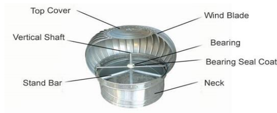
Fig no:3Actual view of Ventilator

For electricity generation purpose dc motor is used. A dc generator is one kind of electrical machine and the main function of this machine is to convert the kinetic energy into DC. The energy alteration process uses the principles of energetically induced electromotive force. Small amounts of energy generated by DC motor depends on speed of rpm.