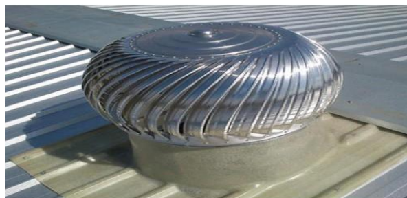
Fig no:2 Roof Top Ventilator

In this paper second type is preferred. Roof ventilator consist of stationary part and rotational part .The stationary part is composed of base and fixed shaft and rotational part is composed of fan blades and bush put on the fixed shaft on stationary part . The construction of roof ventilator shown in following fig 2