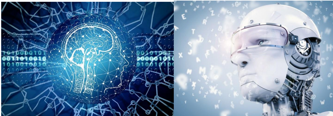
AI can help us respond to COVID-19 – if we ask the right questions about reliability, safety and fairness.

Unfortunately, gaining access to – and reviewing – such documentation may be challenging in practice. The difficulties presented are largely related to deep learning (DL) – a subclass of machine learning – and the degree of maturity of the AI industry.