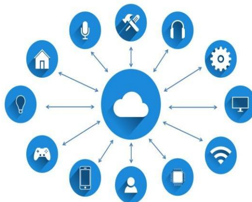
FIG: 1: Cloud Computing

Cloud computing is now the default option for many software's and apps. The main concept of cloud computing is that the location of the services is just irrelevant to the customers who use it they just need the services don't care where is the services being provided from.