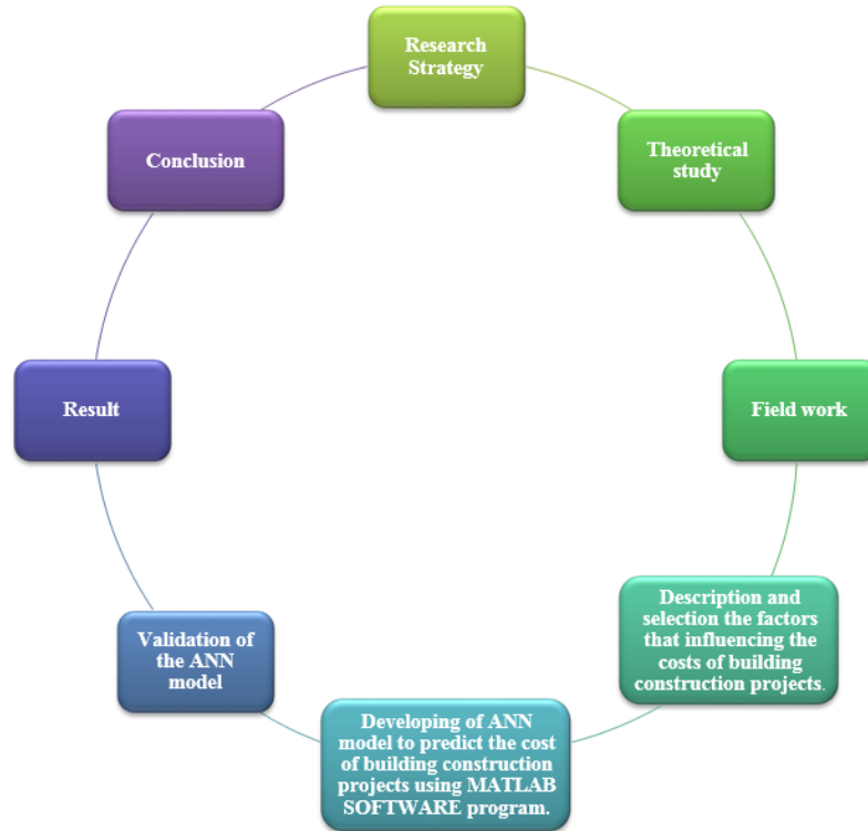
Fig 3. Research methodology

To develop the parameters cost estimation model by applying the artificial neural networks methodology is the essence of this research, which takes the building projects to predict the final cost of construction building projects. This study adopts upon the historical data to training this methodology, using the main factors affecting as inputs to provide historical data to make estimation cost for new projects. The necessary information and required projects data were collected to build the model of estimation construction cost of building projects. Conceptual cost estimation, cost control, cost overrun, cost codes and cost management are reviewed to identify the main topics to be handled in this research. All types of artificial neural networks (ANNs), their structure, and applications are outlined. To achieve the objective of the research, development artificial neural networks model for construction projects cost. The research strategy can be classified into two types namely, quantitative approach and qualitative approach. The both types quantitative and qualitative approach are used to collect thee data of the projects and thee information about the factors which influencing in the construction buildingcost.