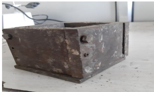
Fig.4 COMPRESSIVE TEST MACHINE CUBE MOULD