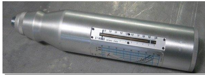
Fig 1. REBOUND HAMMER

When the plunger of rebound hammer is pressed against the surface of the plaster, the spring-controlled mass rebounds and the extent of such rebound depends upon the surface hardness of concrete. The surface hardness and therefore the rebound is taken to be related to the compressive strength of the concrete. The rebound is read off along a graduated scale and is designated as the rebound number or rebound index.