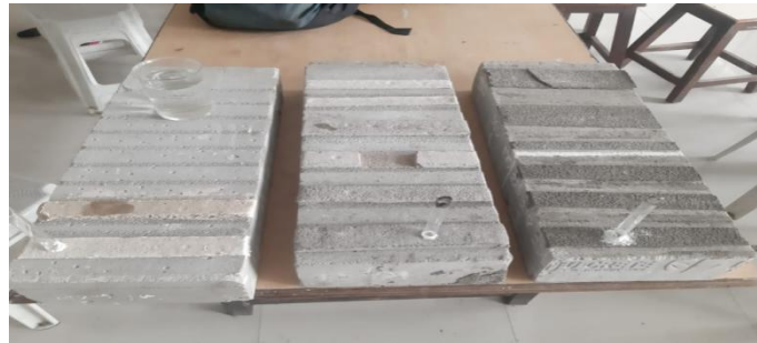
Fig.5 WATER PERMEABILITY