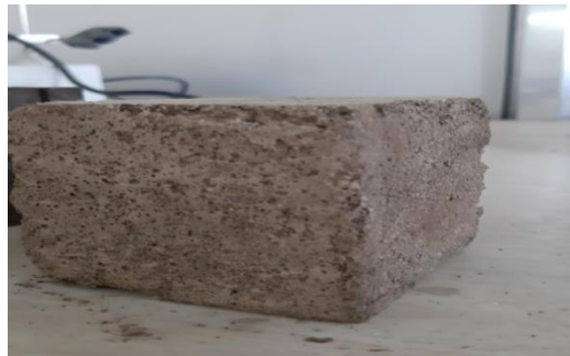
Fig.3 COMPRESSIVE TEST MACHINE CUBE