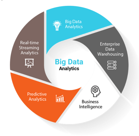
Fig 3 :Working of Big Data Analytics

Big data analysis is very helpful for organisations to provide better business based decisions .As big data is complex , it involves complex norms and applications with elements like predictive models & statistical algorithms , that are helpful for high performance analytics systems .