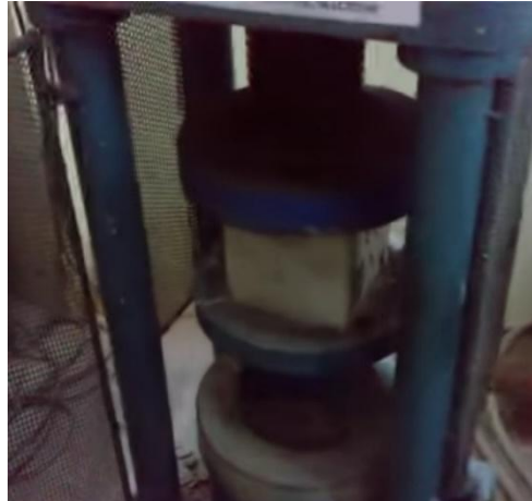
Image 4. Testing of Concrete cubes

Concrete cubes of standard size 150 mm x 150 mm x 150 mm were made using M20 grade concrete. The compression test was done as per IS 516 after curing in water for 7, 14 and 28 days. Test was conducted for both concrete cubes made with tap water and concrete cubes made with treated grey water. The compressive strength values were recorded and compared. The value of concrete cube made with TGW for 7 days of curing was decreased from 21.29 N/mm 2 to 19.95 N/mm 2 . There is no significant difference in the values of concrete made using TGW and Tap water after 14 and 28 days of curing.