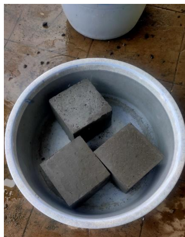
Image 3. Curing of concrete