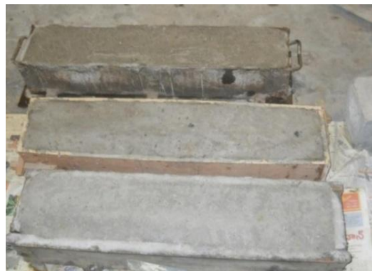
Image 5. Dried concrete beams

Concrete beams of dimension 150 mm x 150 mm x 700 mm were made using M20 grade concrete. The flexural strength test was done after curing in water for 7 and 28 days. Test was conducted for both concrete beams made with tap water and concrete beams made with treated grey water. The flexural strength values were recorded and compared. The values of concrete beam made with TGW for both 7 and 28 days of curing were decreased but still the difference was within limits.