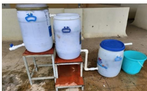
Fig. 1. Filtration treatment unit

Collection of grey water was done from household kitchen appliances in 20 litres capacity buckets. The collected grey water samples were sent to laboratory for testing and studying the initial characteristics of grey water. After studying the initial characteristics, the raw grey water was treated using a filtration treatment unit of 3-barrel system as shown in figure below. The first barrel consists of two screen mesh, screening and floating of suspended materials is carried out in first barrel. After that water was allowed to pass through second barrel which consist of coarse aggregates of size 20 to 10mm. At last water was passed through third barrel consisting of half part of coarse aggregates of size 10 to 4.75 mm and half part of crushed, sieved, washed and dried concrete waste which acts as an alternative to river sand. The sludge valve is also provided for periodic backwashing. The water passed from all three barrels was treated and collected in a storage bucket and further tested before using in making concrete. After treating grey water was tested for its final parameters which were within permissible limits.