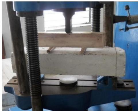
Image 6. Testing of beam