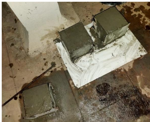
Image 2. Placing of concrete in still position for 24 hours