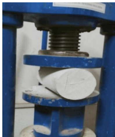
Image 7. Testing of Cylinder

Concrete cylinders of dimension 150mm diameter x 300mm length were made using M20 grade concrete. The Split tensile strength test was done after curing in water for 7 and 28 days. Test was conducted for both concrete cylinders made with tap water and with treated grey water. The strength values were recorded and compared. Not much difference was noted between the values after comparison, thus concluding that TGW can be used as an alternative to normal water in concrete.