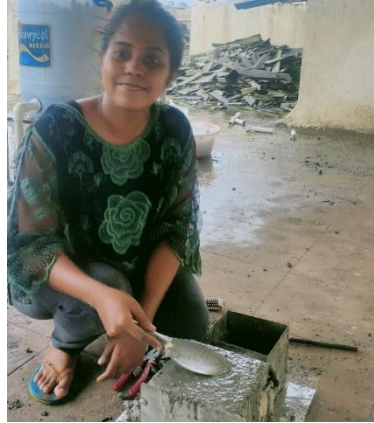
Image 1. Filling of moulds