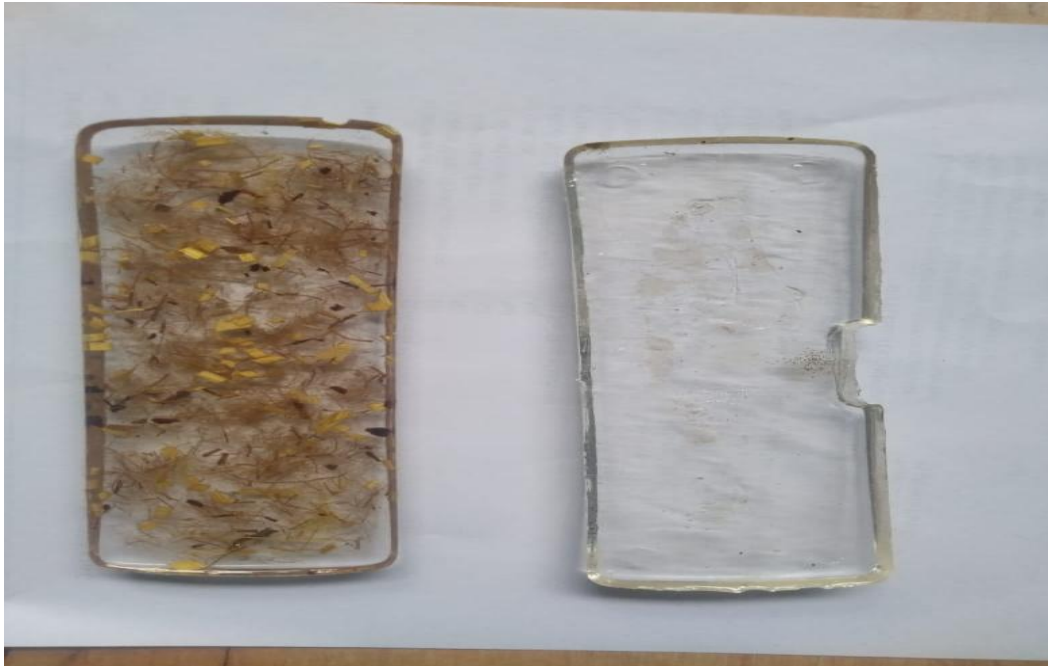
Figure. 3 Natural fiber composite