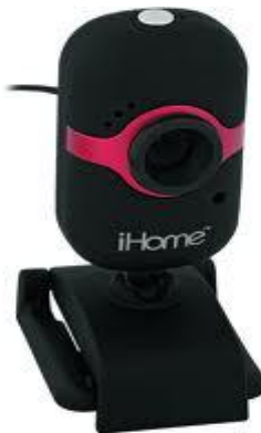
Fig 1 Web Camera

A webcam is a video camera that feeds its images in real time to a computer or computer network, often via USB, ethernet, or Wi-Fi.