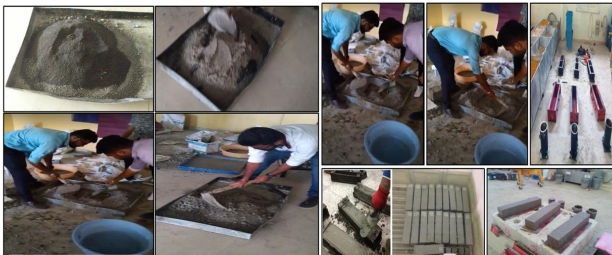
Fig 1: Sequence of Mixing (From Top Left Corner in Clockwise Direction): i) Cement & fine aggregate mixed ii) Course aggregate mixed iii) Water is added iv) All material are mixed appropriately

The test has been performed in standard size 150 X 150 X 150 mm to check the compressive strength with mix for various percentage of steel fiber and replacement of Rice husk Ash has been illustrated in tabular form as follows.