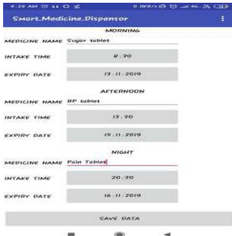
Fig. No.4: Expiry date of pills