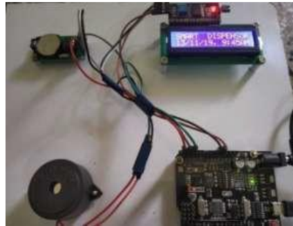
Fig. No.2: Date and time to take pills