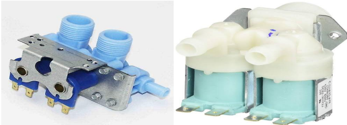
Fig.3 Solenoid Valve

Solenoid valves are the most frequently used control elements in fluidics. Their tasks are to shut off, release, dose, distribute or mix fluids. They are found in many application areas. Solenoids offer fast and safe switching, high reliability, long service life, good medium compatibility of the materials used, low control power and compact design. Domestic washing machines and dishwashers use solenoid valves to control water entry into the machine. They are also often used in paintball gun triggers to actuate the CO 2 hammer valve. Solenoid valves are usually referred to simply as solenoids.