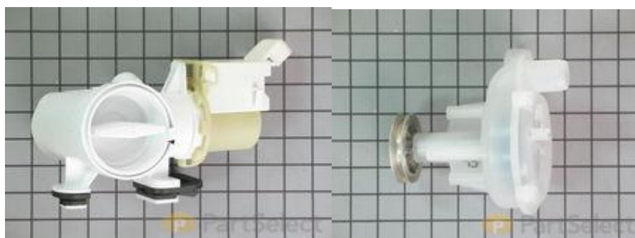
Fig.5 Drain pump

The drain pump removes water from the washing machine tub at the end of the wash and rinse portions of the cycle.