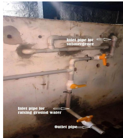
Figure 2. Plumbing Arrangement