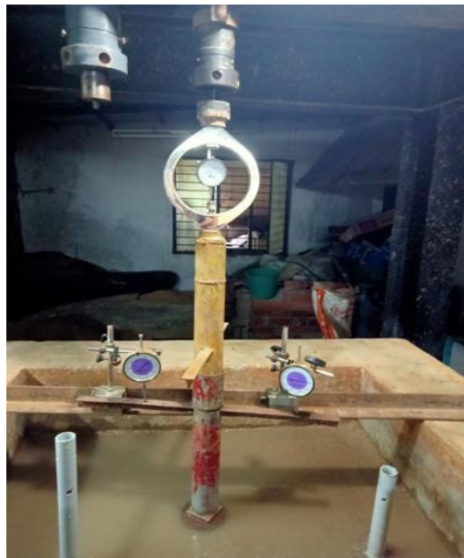
Figure 3. Test setup for Laboratory Scale Load Test