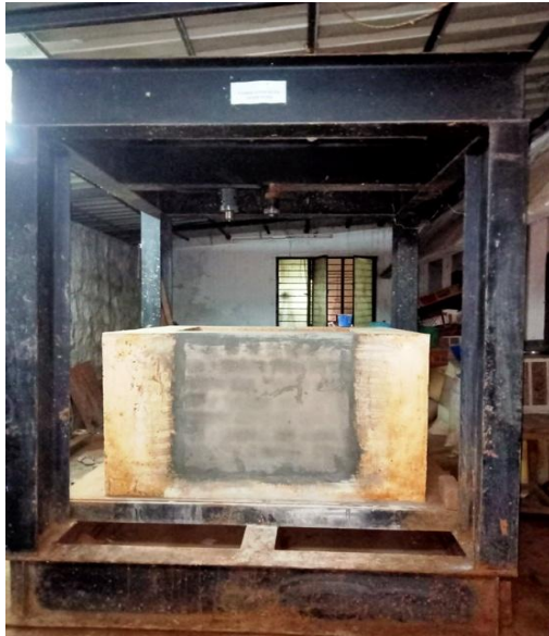
Figure 1. Loading frame