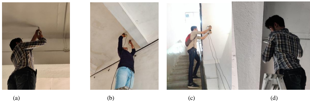
Fig. 3. NDT test (a) Rebound hammer test on slab (b) UPV test on slab (c) UPV test on staircase slab (d) Rebound hammer test on beam

From the above statements, one can conclude that the concrete still retains its strength and is still homogeneous in nature.