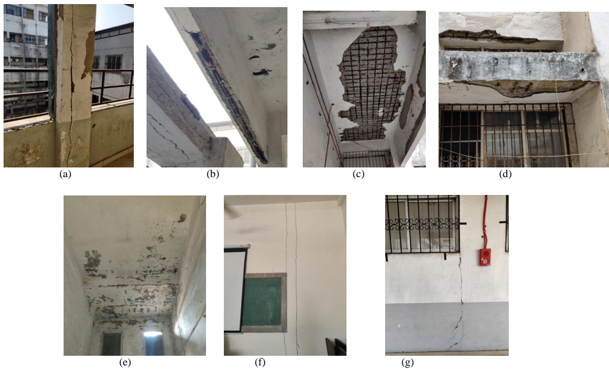
Fig. 2. Visual observations (a) Splitting of columns (b) Spalling of cover concrete in beams (c) Spalling of cover concrete in slabs (d) Deterioration of RCC chajjas (e) Dampness in WC slab (f) Termite infestation (g) Separation cracks between wall and column

NDT was conducted on a few members on every floor. Members were selected in such a way that they represent every type of exposure condition. The findings are enlisted below: -