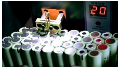
Fig 3 Battery