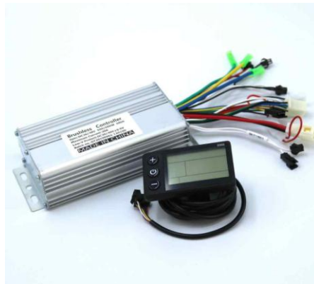
Fig 2 Controller

A motor controller is a device or group of devices that serves to govern in some predetermined manner the performance of an electric motor. A motor controller might include a manual or automatic means for starting and stopping the motor, selecting forward or reverse rotation, selecting and regulating the speed, regulating or limiting the torque, and protecting against overloads and electrical faults.