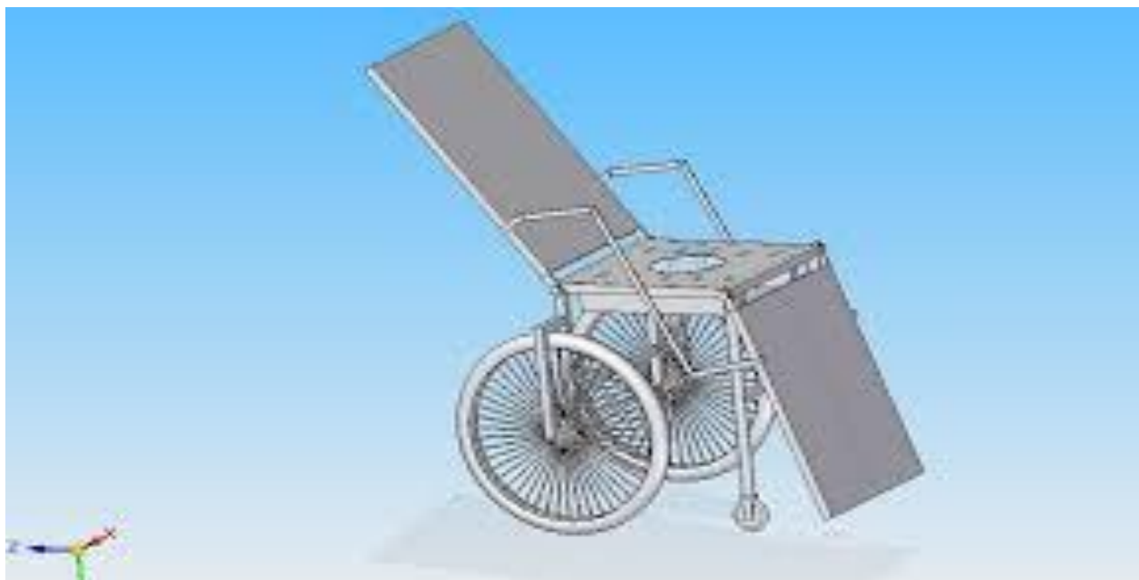
FIGURE 3.1 WHEELCHAIR MODE