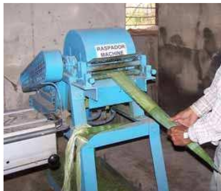
Fig. 2. Mechanical process of sisal fiber extraction using raspador machine[4]

Sisal fiber can be extracted from its leaves by Retting, Boiling and Mechanical extraction ways. Water retting is a traditional biodegradation process involving microbial decomposition (breaking of the chemical bonds) of sisal leaves, which separates the fiber from the pith. The fibers are washed and processed further. This process takes 15–21 days for a single cycle of extraction and decrease the quality of fiber. Retting is a very slow, water intensive process, unhygienic, and not eco-friendly. Mechanical extraction involves inserting leaves into a machine “raspador machine” and pulling the raw material out as shown in fig.2. This process does not deteriorate fiber quality and is suitable for small-scale operations and is efficient, versatile, cost effective and eco-friendly process. Residues produced during and after extraction of fiber are about 96% which is useful for biogas generation, composting, and isolation of a steroid, ecogenin, making paper, biodegradable polymer and wax.