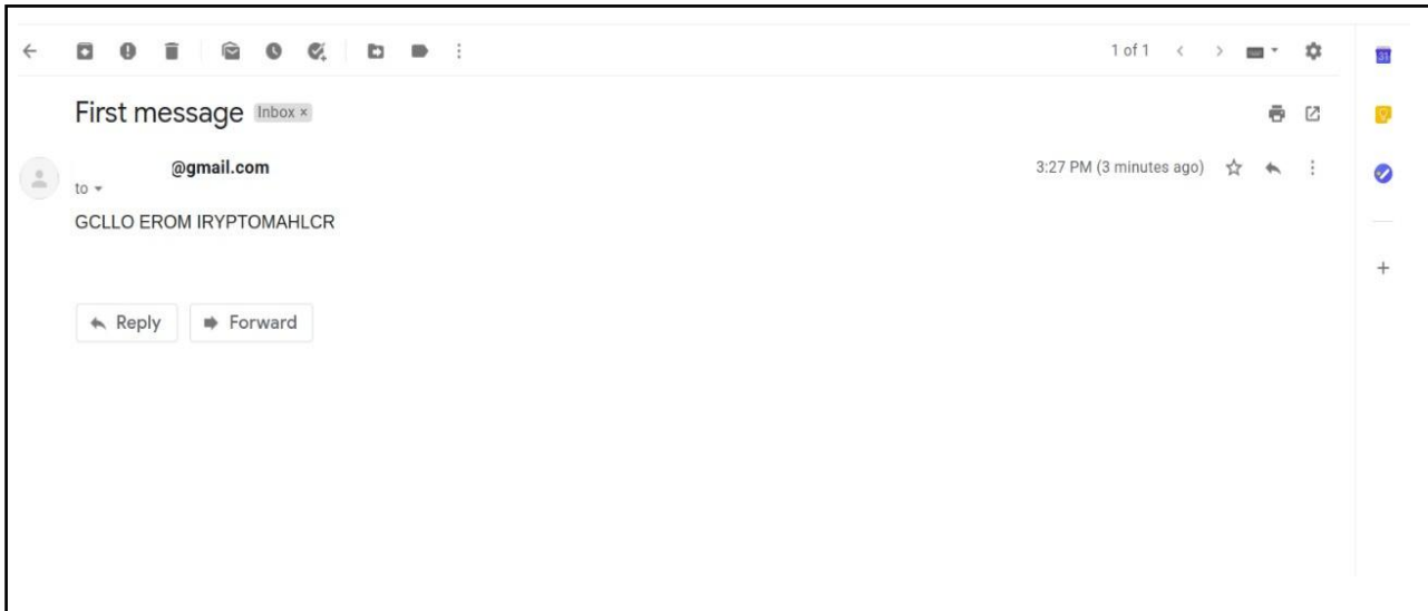
Fig 4: Inbox of the Receiver

Fig 4 shows the inbox of the receivers account where we can see that the message is successfully received from the intended sender and the message is also in the encrypted form.