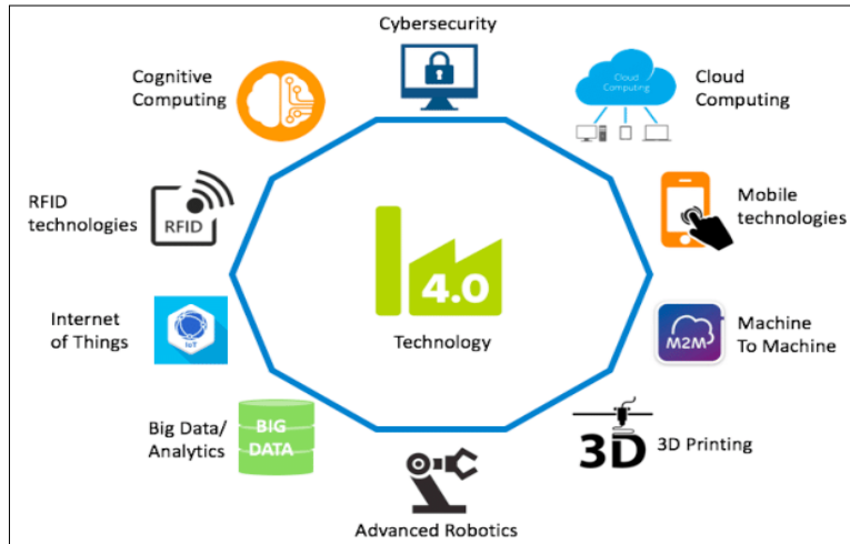
Fig.: Components of Industry 4.0