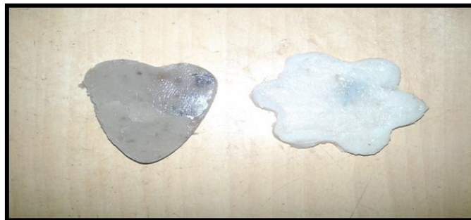
Figure 3: Biodegradable plastic mould

Figure 3 shows the biodegradable plastic mould. Moulding is the process of manufacturing by shaping liquid or pliable raw material using a rigid frame called a mould or matrix. This it may have been made using a pattern or model of the final object. Moulding is the process of forcing melted plastic in to a mould cavity. Once the plastic has cooled, the part can be ejected. As the figure 3 showing the biodegradable plastic that has been made is mouldable into various shape. Therefore, biodegradable plastic that have been made is a conventional plastic where it can replace the petroleum based plastic that is most popular amount the plastic moulding.