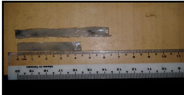
Figure 2: Elongation test on biodegradable plastic