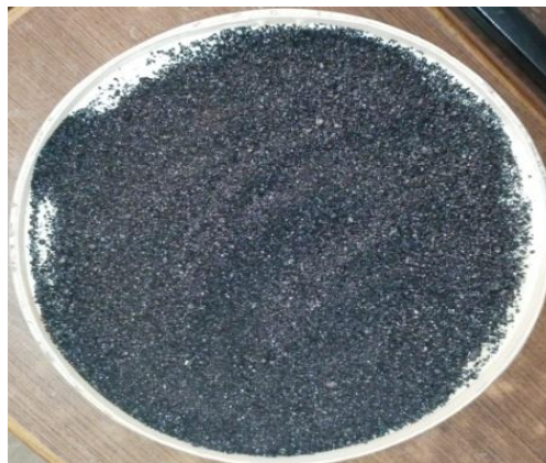
Fig. 1 Copper slag

Copper slag is a by-product material produced from the process of manufacturing copper. As the copper settles down in the smelter, it has a higher density, impurities stay in the top layer and then are transported to a water basin with a low temperature for solidification. The final product is a solid, hard material that goes to the crusher for next processing. Copper slag is an irregular, black, glassy and granular in nature and its properties are similar to the river sand. Copper slag used in this work was brought from Sundara Enterprises (zone-II), a dealer in Bhosari MIDC area, Pune. The nature of copper slag used in experimental work shown in fig. 1. The physical and chemical properties of Copper slag are shown in table 3 and table 4.