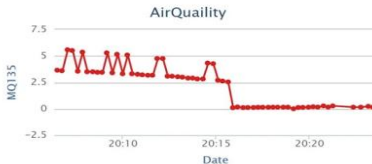
Fig 3: Air Quality Graph

The figure above shows the field charts of DHT11 sensor values for the location where the experiment is conducted in PPM (Parts per million). We can see the visualization charts for this sensor as well.