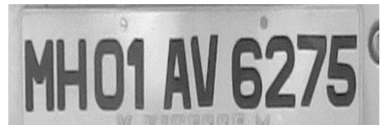
Figure 2.6: Extracted number plate