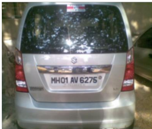
Figure 2.1: Raw image of a car

In Figure 2.1, raw image in which the number plate is visible is given as input. In figure 2.2, the input image is converted into gray scale to remove noise which helps in better image processing. In figure 2.3, Histogram equalization method is used to enhance the contrast of the image by converting the values in an intensity image. In figure 2.4, the equalized image is later Binarized to get a shallow view of the plate and its characters. In figure 2.5, Sobel Edge Detection method is used character recognition. It highlights regions with a high edge magnitude and high edge alteration. In figure 2.6, only the Plate region is extracted to detect the number plate in the Image. In figure 2.7, Characters being recognized and segmented individually. For character recognition we use deep neural network algorithm. In figure 2.8, result is displayed in string format.