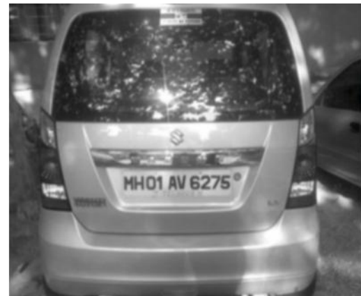
Figure 2.2: Gray scale image