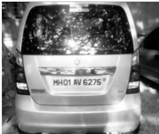
Figure 2.3: Histogram Equalization