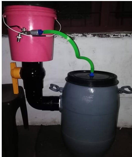
(b) Biogas generation unit