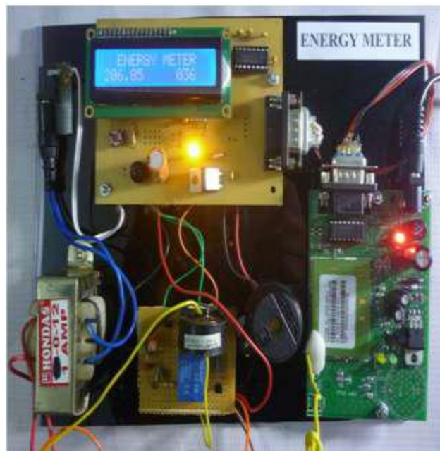
Fig.3 Hardware of energy meter

A buzzer or beeper is an audio signaling device, which may be mechanical, electromechanical, or piezoelectric. Typical uses of buzzers and beepers include alarm devices, timers and confirmation of user input such as a mouse click or keystroke. It is used for beep an alarm during overload.