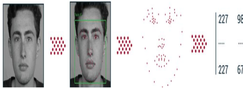
Fig. 1. Facial feature detection