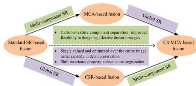
Fig. 1 Proposed System

DUE to the diversity of image capture mechanisms, medical images may reflect different categories of knowledge about organs / tissues. For example, the computed tomography (CT) images will clearly show dense structures such as bones and implants, while the soft tissue magnetic resonance (MR) images provide anatomical details of high resolution. The goal of the pixel-level medical image fusion technique is to combine the complementary information in multi-modal medical images by producing a composite image that is hoped to be more appropriate for physician observation or machine perception. During the last few decades a number of imaging fusion approaches have been proposed. These methods can generally be divided into four groups based on the accepted technique of image transformation: methods based on multi-scale decomposition (MSD), methods based on sparse representation (SR) conducted in other fields and methods based on the combination of different transforms. In this paper we concentrate above all on SR-based image fusion.