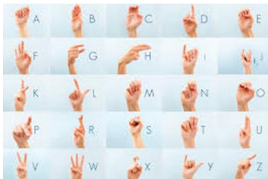
Fig. 1 Sign Language of Alphabets

Various images of hand gestures are collected as folders. Fig. 1 shows the gestures of alphabets.