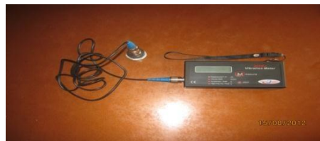
Figure 4: Vibration Meter

Chatter always gives rise to defects on the machined surface; vibration especially self-excited vibration is associated with the machined surface roughness. A Vibration Meter 908Be series type measurement device (Fig 4), was used for measuring the amplitude and velocity of a point on the cutting tool. The tool vibration level was measured using a vertical data of a transducer mounted near to the tip and connected to the devices. The data include displacement and velocity of the indicated point on the tool for each sample. The acceleration was calculated by using general equation relating amplitude to acceleration.