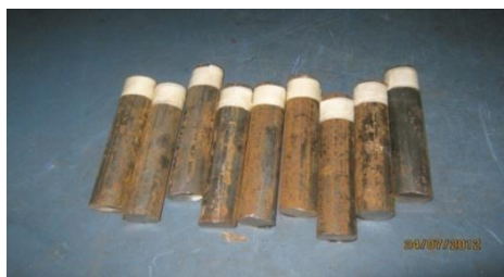
Figure 1: Work-Piece Material

The following Materials and equipment are used to perform the experiment; Work-piece type 41Cr4 alloy steel round bar of 25Ø x 150 mm with the following specifications; (UTS = 902.83 N/mm 2 , BHN = 278.55 and chemical composition of 0.4% C, 0.25 S, 0.65 Mn, 1.0 Cr) (Fig 1); conventional lathe Machine (Fig 2) with carbide (F30 Type) cutting tool (Fig 3) of dimension (25x25x12.5mm) type (HSS-718) with the following angles; back and side rake angle is 10°, 12° respectively, side relief angle is 5° and side cutting edge angle is 15° using the standard angle given in Jaton N.W[11].