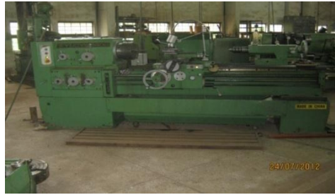
Figure 2: Lathe machine