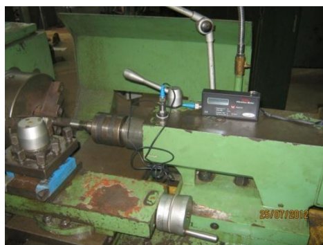
Figure 5: Set-Up for the Measurement of Induced Vibration