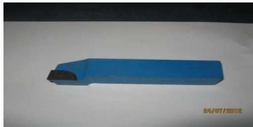
Figure 3: Cutting Tool