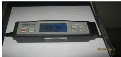
Figure 6: Surface Roughness Tester

considered as surface texture of the turned surface.