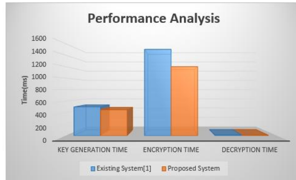
Fig. Performance analysis

To evaluate the performance, the schemes in [1] and Proposed system are simulated using the Stanford javax.cipher library. The experimentson these schemes are conducted on a laptop running Windows operation system with the following settings: CPU: Intel core i5 CPU at 2.5GHz; RAM memory: 4 GB