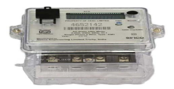
Figure:6 Bi-directional Meter

g) SCADA: The components required for the reliable operation of the overall system are system control and monitoring, the energy management system (EMS), and system thermal management. System control and monitoring is general (IT) monitoring, which is partly combined into the overall supervisory control and data acquisition (SCADA) system.it also provide real time data and real time fault analysis. By using plc and SCADA we can control the operation of windmill which are located in remote location.