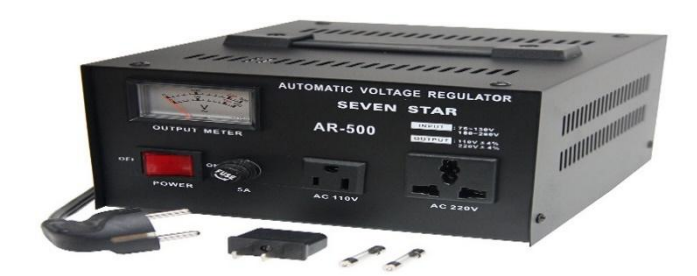
Figure:4 Automatic Voltage Regulator

d) VOLTAGE REGULATOR: Voltage regulator is electrical or electronic device which provide suitable power supply. Its work is automatically. Depending on the design, it may be used for AC or DC voltages. Feedback voltage regulators operate by comparing the actual output voltage signal with some fixed reference voltage signal. If error is occurred then by adding or reducing the voltage level it can math with reference voltage. And according to set voltage level, voltage regulator provide output.