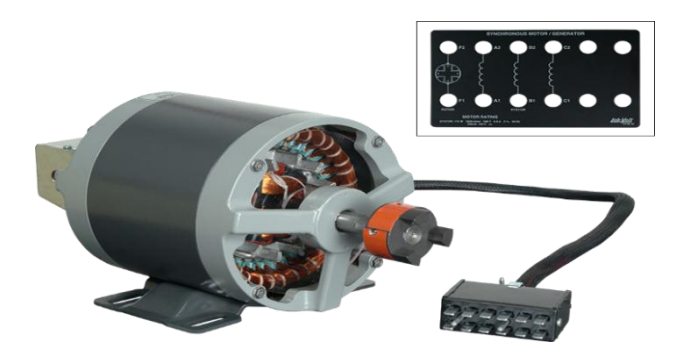
Figure: 3 Synchronous Generator

d) VOLTAGE REGULATOR: Voltage regulator is electrical or electronic device which provide suitable power supply. Its work is automatically. Depending on the design, it may be used for AC or DC voltages. Feedback voltage regulators operate by comparing the actual output voltage signal with some fixed reference voltage signal. If error is occurred then by adding or reducing the voltage level it can math with reference voltage. And according to set voltage level, voltage regulator provide output.