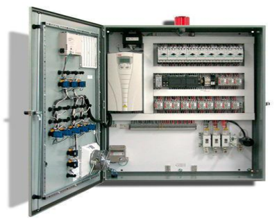
Figure: 7 SCADA Panel And PLC

g) SCADA: The components required for the reliable operation of the overall system are system control and monitoring, the energy management system (EMS), and system thermal management. System control and monitoring is general (IT) monitoring, which is partly combined into the overall supervisory control and data acquisition (SCADA) system.it also provide real time data and real time fault analysis. By using plc and SCADA we can control the operation of windmill which are located in remote location.