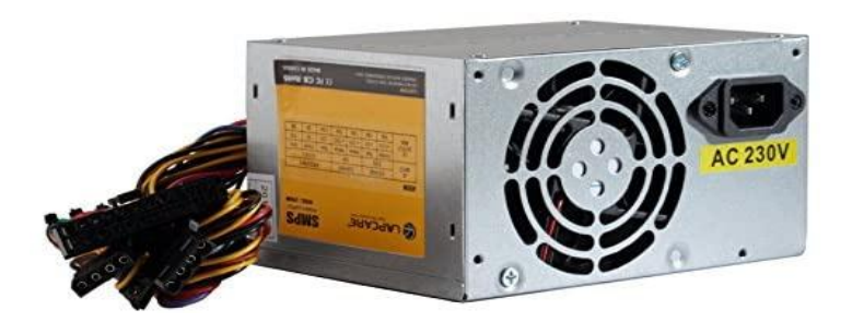
Figure: 5 Switch Mode Power Supply

e) SMPS:SMPS full form is switch-mode power supply. Its work is to convert AC voltage power to lower voltage DC power. It provides multiple output terminal. Mostly SMPS are used for computer system devices also in industrial machine tool. In our project we required multiple voltage for various application so we use SMPS to fulfil the multiple voltage requirements.